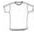
Page 25 7114 – Shoulder Insert with Side Piping